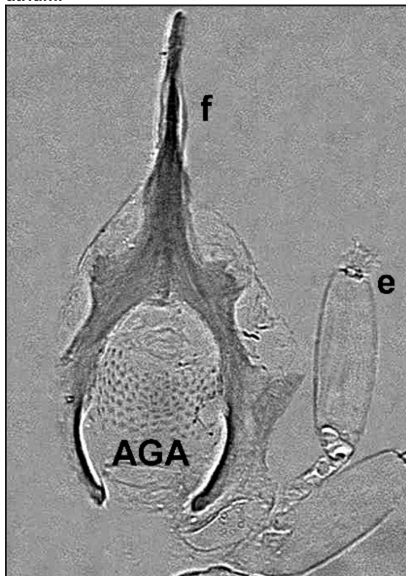
Fig. 1. Photomicrograph of the genital furca Lutzomyia (Psathyromyia) scaffi – f: furca; e: spermathecae; AGA: armature in the genital atrium.

eggs or engorged were separated into individual tubes oviposition. For all three species, the first generation of laboratory reared females was obtained according to the methodology described by Killick-Kendrick & Killick-Kendrick 1991 ( Parasitol. 33 : 315-320) and Pessoa et al. , 2008 ( Zootaxa. 1740 : 1-14). The identification of cryptic species females was confirmed by identification of the reared males